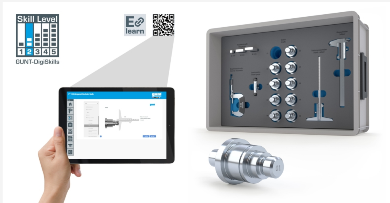
The illustration shows the device and the GUNT Media Center on a tablet (not included).