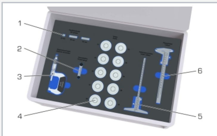
1 slip gauge, 2 thread gauge, 3 external micrometer, 4 test objects (shaft), 5 depth calliper, 6 calliper